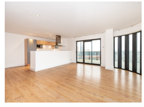
Point Central, Sydenham Road, Croydon, Surrey, CR0