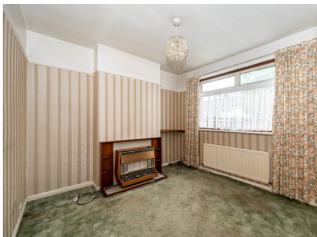
Rosedene Avenue, Croydon, Surrey, CR0