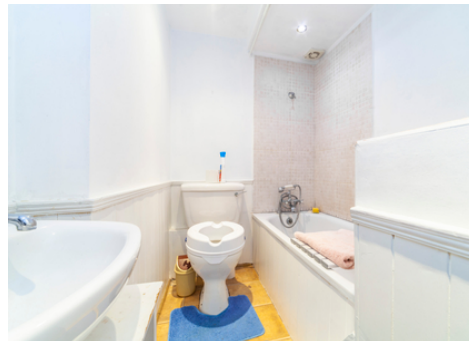
Lambeth Road, Croydon, Surrey, CR0