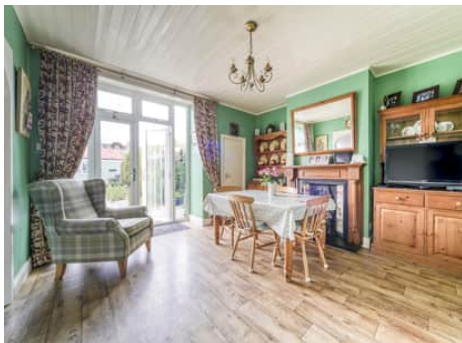
Headcorn Road, Thornton Heath, Surrey, CR7