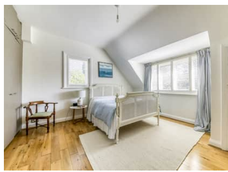
Croham Park Avenue, South Croydon, Surrey, CR2