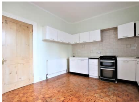
Elgin Road, Croydon, Surrey, CR0