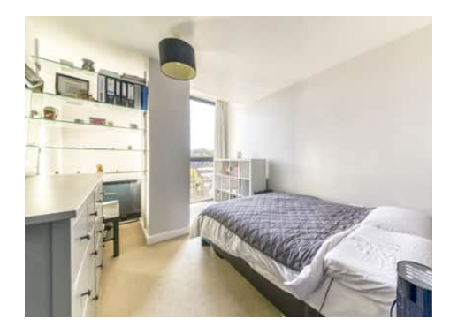
Centrillion Point, Masons Avenue, Croydon, Surrey, CR0