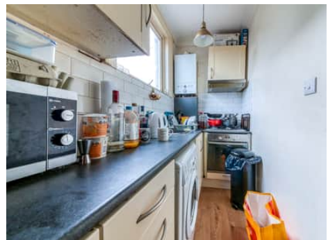
Anerley Road, London, SE20 8DL