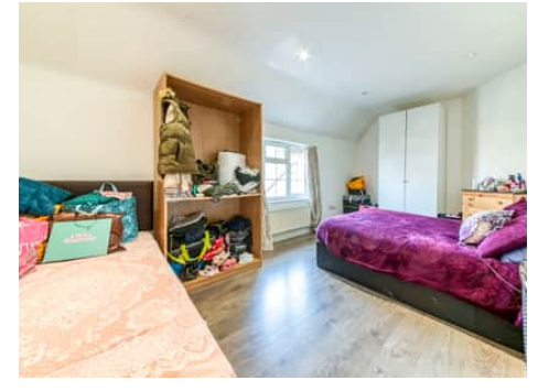
Gibbs Close, London, SE19 1JL