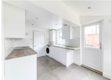
Wortley Road, Croydon, Surrey, CR0 3EB