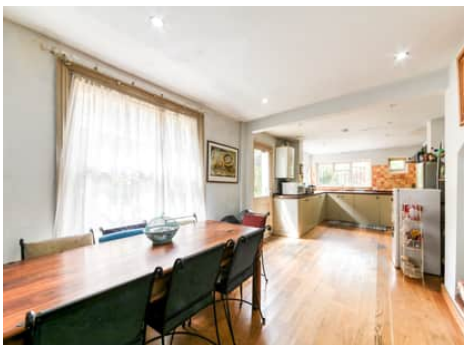
Norwood Road, London, SE24 9BB