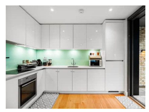
Vita Apartments, Caithness Walk, Croydon, Surrey, CR0 2WD £350,000 Leasehold