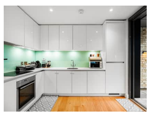
Vita Apartments, Caithness Walk, Croydon, Surrey, CR0 2WD