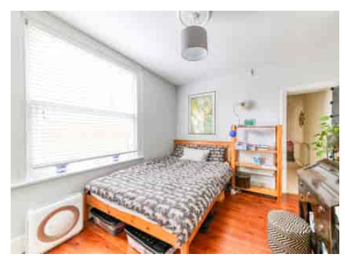
London, SE19 3NN £400,000 Share of Freehold