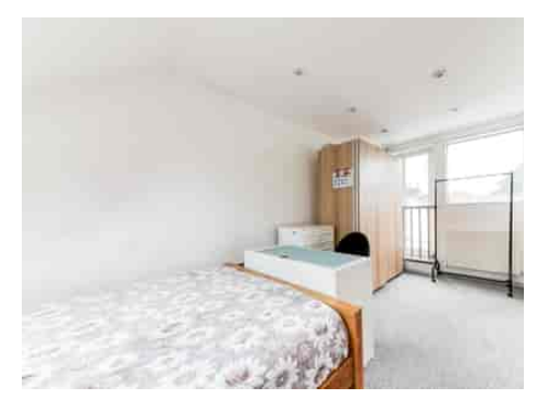
Princess Road, Croydon, Surrey, CR02QZ