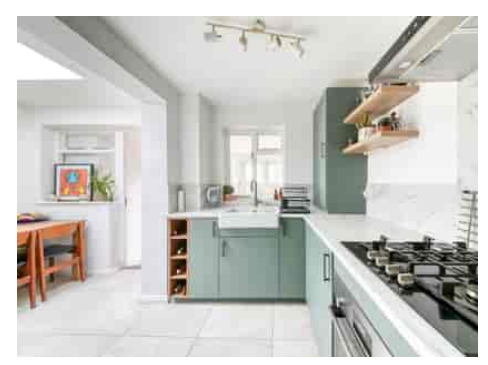
Pawsons Road, Croydon, Surrey, CR0 2QF £400,000