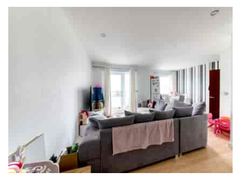
Newgate, Croydon, Surrey, CR0 2FB