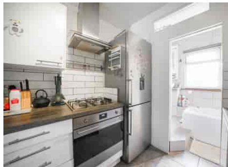
Westbury Road, Croydon, Surrey, CR0 2ES